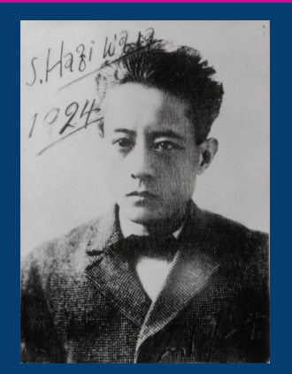
Portrait photograph of Hagiwara Sakutaro