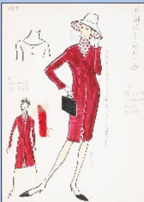
Costume design from You Can Succeed, Too (1964, Toho)