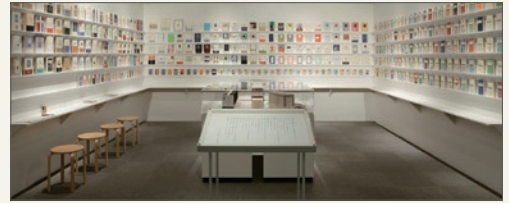
2nd Floor Exhibition Room