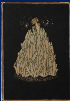
Howling at the Moon (1917 Kanjoshisha, Hakujuitsusha)

In the preface to this collection of poems, Sakutaro expresses a sense of loneliness with a keen and delicate sensibility, writing: "Poetry is not a mystery, nor a symbol, nor a demon. Poetry is merely consolation for those whose souls are ailing, and for those who are lonely."